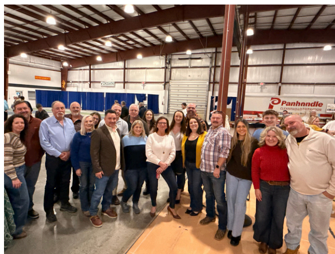
Mon Stonewall Jackson Memorial Hospital Team at the Fish Fry