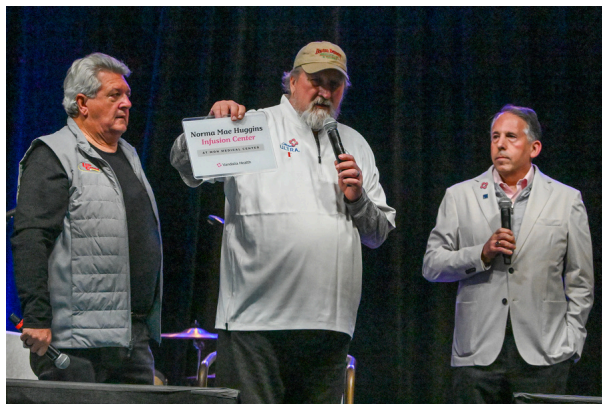
Fish Fry

This tribute serves as a lasting reminder that philanthropy is deeply personal. Every gift, every gathering, and every named space represents lives touched and stories remembered, ensuring that care extends beyond medicine to the connections that make healing possible.